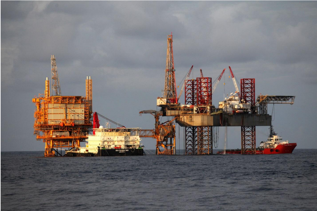
Ruby gas field: WHP and PQP platforms with drilling rig